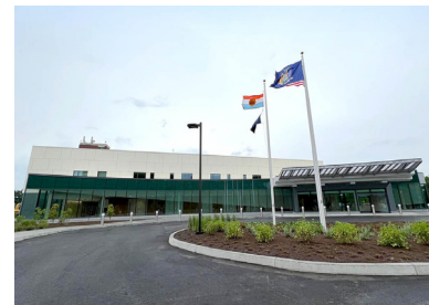
New HealthAlliance Hospital Photos L-R: Entrance; Nurse's Station; Main Entrance.